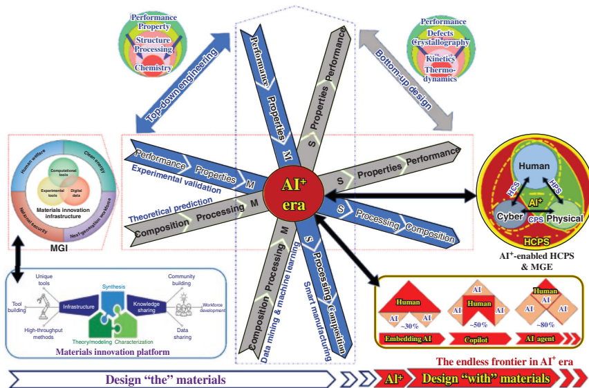
Figure 1.9 The field is moving beyond data-driven ICME, entering an AI + era of intelligent materials design and manufacturing [112, 117]. Inset of the Materials Innovation Platform adapted from [129].

DTs enable real-time, information-physical integration and are key enablers for smart manufacturing in aerospace, rail, and engine sectors [111, 117, 123]. Process-to-structure and structure-to-property models underscore how materials knowledge turns data into manufacturing intelligence [122, 123]. With advances in LLMs and next-generation AI [124–126], human–cyber interaction will evolve significantly, continuing the shift from material design paradigms toward designing with materials in the AI + era [127, 128].