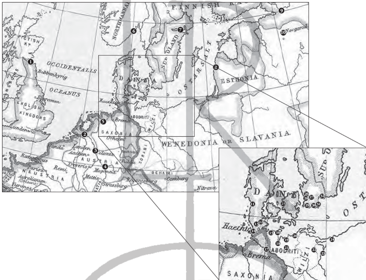
Fig. 2. Map of Northern Europe with the most important sites mentioned in the text.

1. Lindesfarne, 2. Dorestad, 3. Cologne, 4. Mainz, 5. Emden, 6. Kaupang, 7. Birka/Helgö, 8. Grobina, 9. Staraja Ladoga, 10. Ryurikovo Gorodishche, 11. Ribe, 12. Kosel, 13. Hedeby, 14. Elisenhof, 15. Scharstorf, 16. Starigard Oldenburg, 17. Hamburg, 18. Lübeck, 19. Groß Strömkendorf, 20. Rostock-Dierkow, 21. Mecklenburg, 22. Menzlin, 23. Szczecin, 24. Wolin, 25. Trelleborg (Slagelse), 26. Löddeköpinge, 27. Lund, 28. Bjärred, 29. Trelleborg (Scania), 30. Ystad, 31. Järrestad, 32. Åhus.