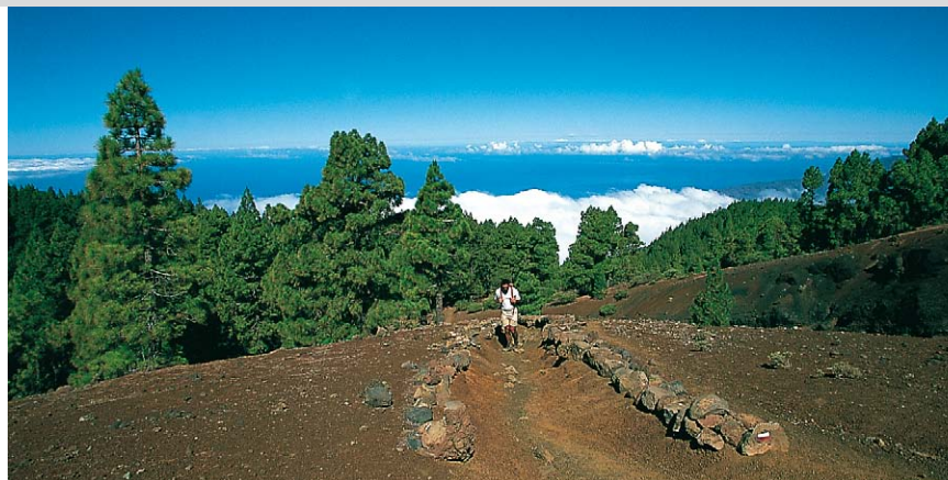
The ascent to the ridgeline of the Cumbre Vieja.

From the road go straight through the picnic area to the Refugio del Pilar and 50m after the Visitor Centre (interesting exhibition about the Cumbre Vieja) keep right at the fork in the direction of 'Los Canarios' ( GR 131, white/red ). After 10 minutes keep right again at the fork. The footpath runs at first through marvellous pine wood and the view opens out later of the mountains surrounding the Caldera de Taburiente and of the Aridane Valley. Now cross the gritty volcanic hillside of Pico Birigoyo – only ferns, gorse bushes and pines brighten the landscape which is dominated by black sand. After a total of 40 minutes the path joins a forest road which is followed uphill to the left. 15 minutes later – once again in an open pine forest – the GR 131