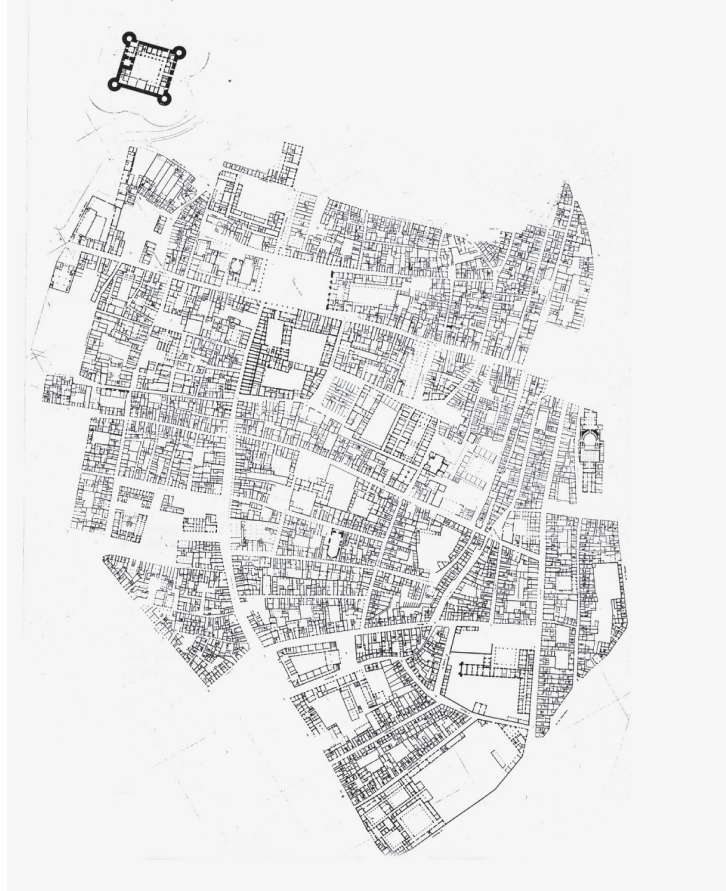
Fig. 1: Gruppo Architettura, Plan of the ancient centre of Pesaro , 1974

how it was made, but in what state it reaches us, with all the inputs linked to its gradual alteration, development and changing role. According to Caniggia and Maffei, it is the product of spontaneous consciousness (the house as it is constructed in a certain period, in a certain culture and place). The typological process consists of a succession of changes over time and distinctions in space, according to reciprocal influences between space and time. The tangible space of living is constructed within this relationship and its historicity and unicity defined 7 .